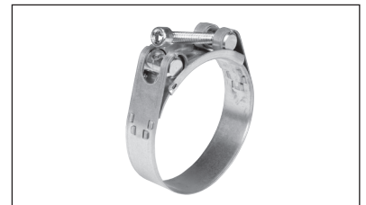
GBS QRC Closure