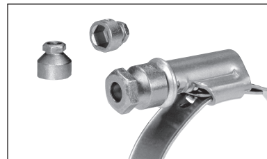
TORRO torque cap